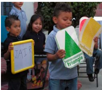
These children are showing their friends and family what they've learned while in LAUP. They are ready to move on to Kindergarten.

What is LAUP? Los Angeles Universal Preschool is a program that began in Los Angeles County in 2005 to insure that 4 year old children receive a high quality preschool experience before entering Kindergarten. It is funded through Proposition 10, the tobacco tax initiative. There is no income requirement, however some families pay a modest 'investment fee'. Age eligibility and residence in L.A. County are the only other requirements. CCD is one of two remaining Hub agencies in LA